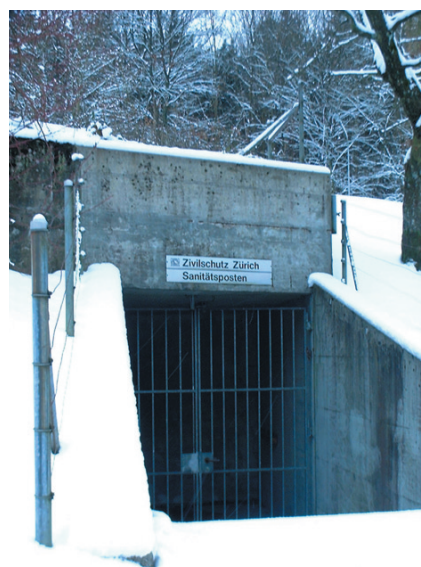
Fig. 3 Shelter at the apartment where I stayed.