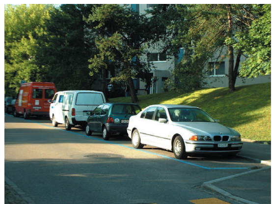
Fig. 2 Street in a residential area of Zurich.

The basis of this strategy is the belief that drug use will never be eradicated as long as addicts are treated as criminals. This approach views drug addiction as a kind of disease. Of course, not everyone supports this policy, particularly those who did not witness the miserable state of Zurich before these measures were introduced (addicts using drugs in public, used syringes scattered around public parks, etc.). Still, it is a truly rational system that considers the interests of both addicts and the general public, and takes realistic, balanced measures without clinging to ideals.