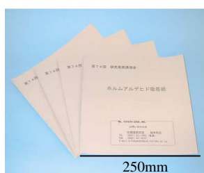
Fig. 1 Formaldehyde-adsorbent sheets.