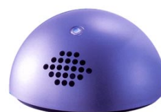
Fig. 3 Negative ion generator. (Patent pending) Brand name: IONVEIL